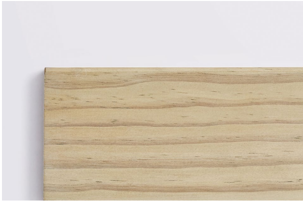
Sand Decking – Pearl Protector Oil