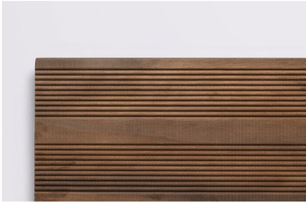
Vulcan Decking – Uncoated