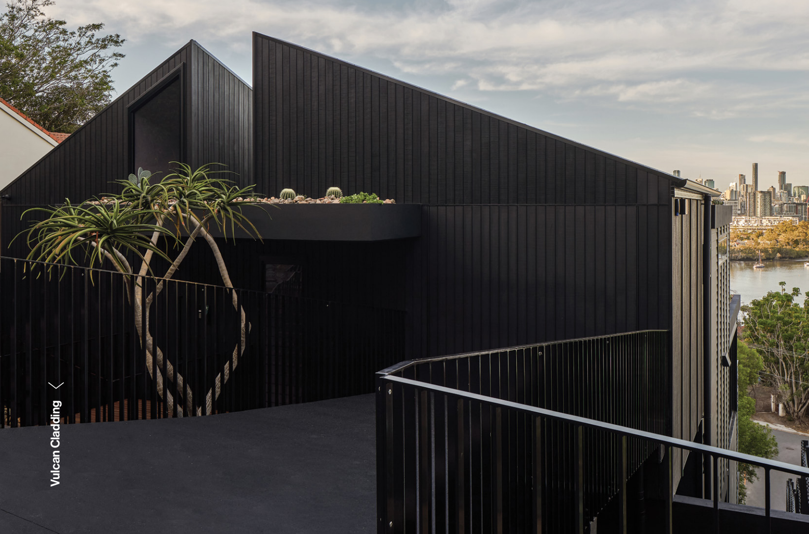
Vulcan Cladding <